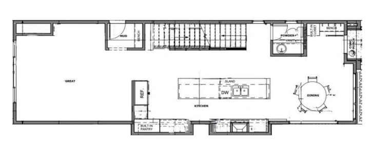
Main Floor Plan